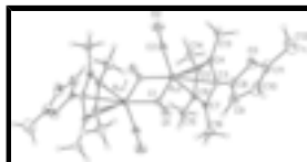
Fig. 1. The structure of the title compound with labeling and displacement ellipsoids drawn at the 30% probability level (symmetry code: i = -x+1, -y, -z ).